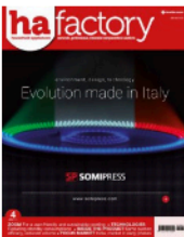
n.4 - April 2022