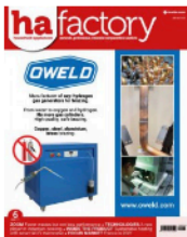
n.6 - June 2022